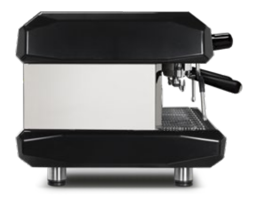
Black + Stainless steel