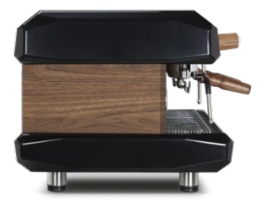
Black + Wood*