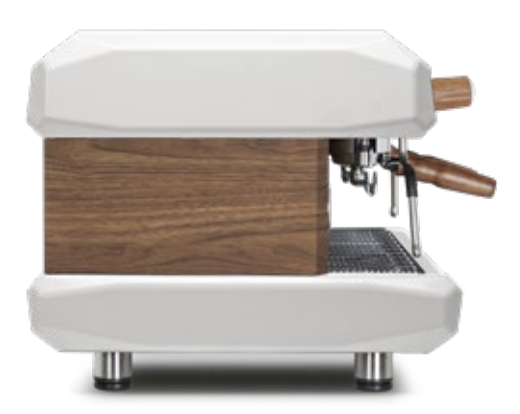
White + Wood*