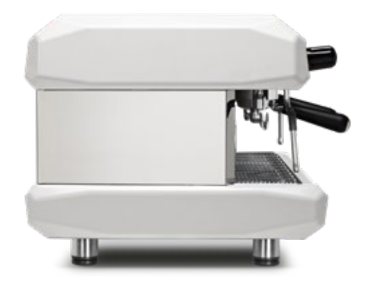
White + Stainless steel